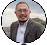
HANANIEL WIDJAJA ex-CEO National Hospital Indonesia